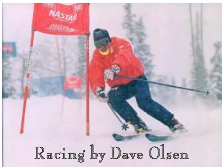
Racing